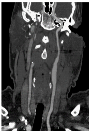
Figure 5: Resolution of intimal surface irregularity after dual antiplatelet therapy for 6 months.

Two weeks later he developed amaurosis fugax in the ipsilateral eye. Computed tomography angiography (CTA) revealed significant irregularity on the intimal surface of the patch. This was considered secondary to deposition of numerous thrombi on the vessel lining. Amaurosis fugax was considered to be secondary to distal embolization of these thrombi. He was started on treatment with dual antiplatelet drugs – aspirin and clopidogrel. Follow up CTA 6 weeks later revealed significant resolution of the vessel wall irregularity. He was seen in clinic 7 months later with exam revealed mild neurological deficits consisting of mild right hemiparesis and expressive aphasia without any further recurrences. He has been maintained on Aspirin and Clopidogrel along with aggressive medical management and has not had any recurrence of symptoms (Figure 1-5).