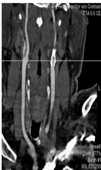
Figure 2: CTA shows acute left internal carotid stenosis. Stent visualized in-situ.

The patient is a 59 year-old male with a history of uncontrolled diabetes, hyperlipidemia and hypertension. He had a remote history of traumatic left internal carotid artery dissection in 1996, and presented with a left parietal stroke that was treated with CAS in 2003. Subsequently, he presented in 2016 with partially occluding in-stent