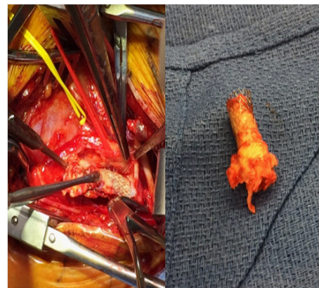
Figure 3: Carotid endarterectomy performed for stent removal. Resected stent with in-stent thrombosis.

thrombus and acute left hemispheric stroke, which was treated with intravenous alteplase. Etiology of the stroke was partially occluding in stent thrombosis of the left internal carotid artery. He underwent CEA under general anesthesia and the carotid stent was removed en bloc along with the underlying atheromatous disease. Pathologic examination was not requested. The carotid arteriotomy was closed using Vascu-Guard bovine pericardial patch angioplasty and 6-0 running polypropylene sutures. The Patient was discharged on aspirin 325 mg.